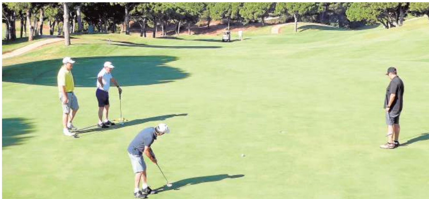
The course was in perfect condition and the weather was lovely for the golfing event at Cabopino.

"Before the year 1890 this profession didn't exist. Now it is respected, solid, mature, uniform and well prepared," say sources at the Spanish Association of Greenkeepers, where these professionals, who in general are specialists, share their knowledge with colleagues and their teams, enriching the culture of golf in the sector. And maintaining the courses in optimum condition, it goes without saying.