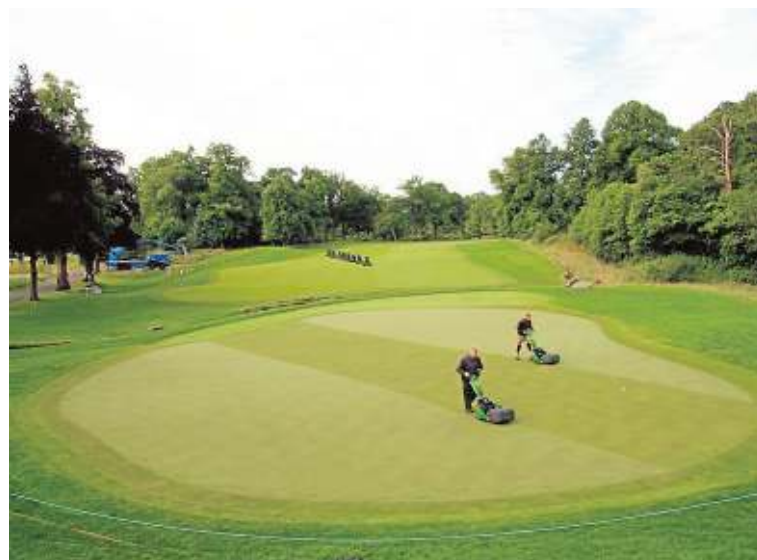
The courses are in perfect condition, ready for the peak season. :: SUR

them to reinvent themselves. There are specific qualifications now, and the studies include golf course design and construction, botany, landscaping, hydraulics, applied economics,