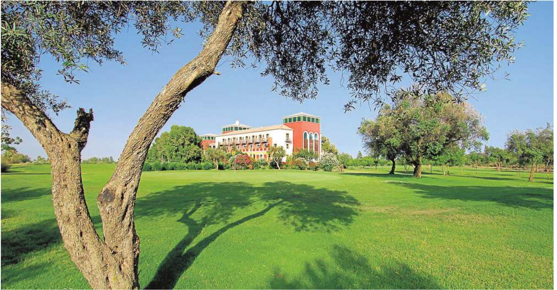
Isla Canela Golf Resort is renowned for its natural surroundings, proximity to the sea and to the leisure facilities of nearby towns. :: SUR