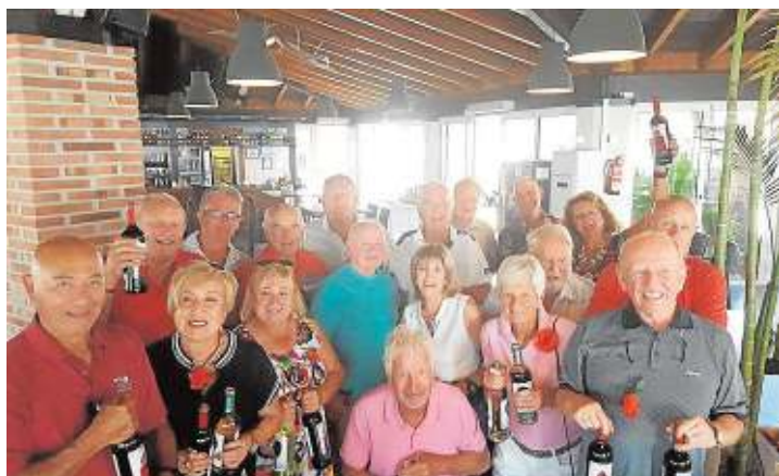
▲ GINs. Golf International Nerja Society enjoyed their very own War of the Roses at Los Moriscos on 30 June with The House of Lancaster (pictured) ultimately coming out on top in the match play with 10 victories to York's eight.