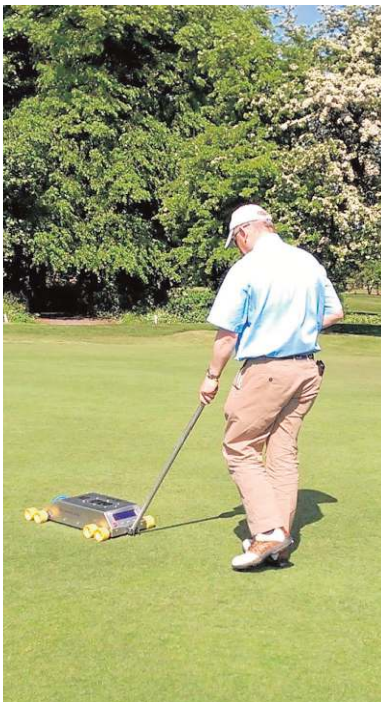
Greenkeepers carry out improvements all year round.

"He was a visionary. He never saw this as a business. He realised that