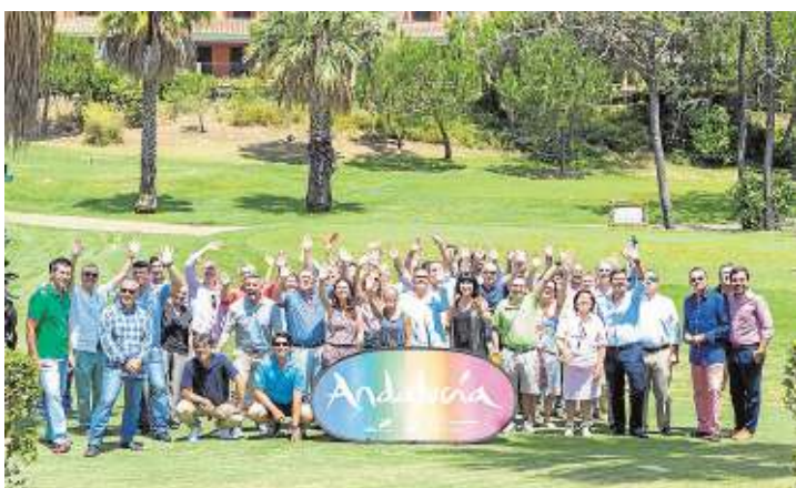
▲ Andalucía. The regional Sport and Tourism boards recently hosted the sixth edition of the Andalucía en Verano tournament in Islantilla (Lepe). The tournament is a way to bring together professionals and companies specialising in golf.