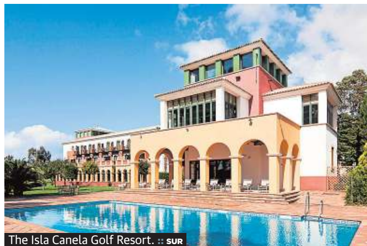
The Isla Canela Golf Resort. :: SUR

For families and travellers who want to enjoy the Isla Canela experience in a more independent way, there is also the possibility of staying in one of the fantastic apartments which the complex has in two nearby but very different areas: some of the apartments have sea views, and others look over the golf course.