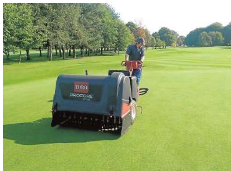
The equipment has been renewed in recent years.

health and safety in the workplace, gardening, mechanics and environmental management.