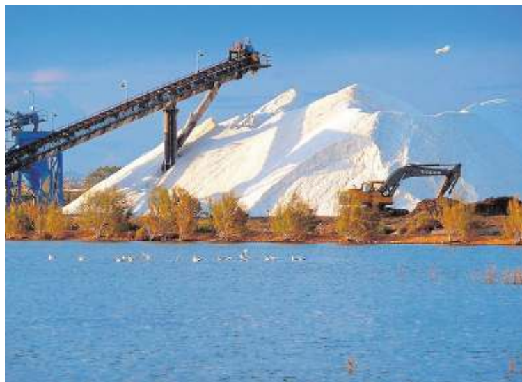
Salt extracted from the Odiel marshes. :: SUR

This is definitely the perfect destination for anybody who wants to enjoy playing golf in an area which offers all the facilities they need. It is now consolidated as a hotspot for golfers, especially as its courses can be enjoyed at any time of the year.