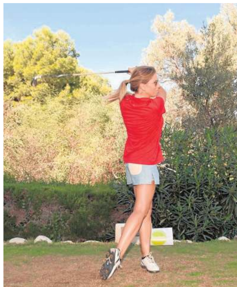
The recovery of the sector has now been confirmed. :: SUR

The return of professional tournaments to Spain has encouraged numerous golf courses in Andalucía to carry out improvements in recent months. The European Circuit has decided to return to this destination