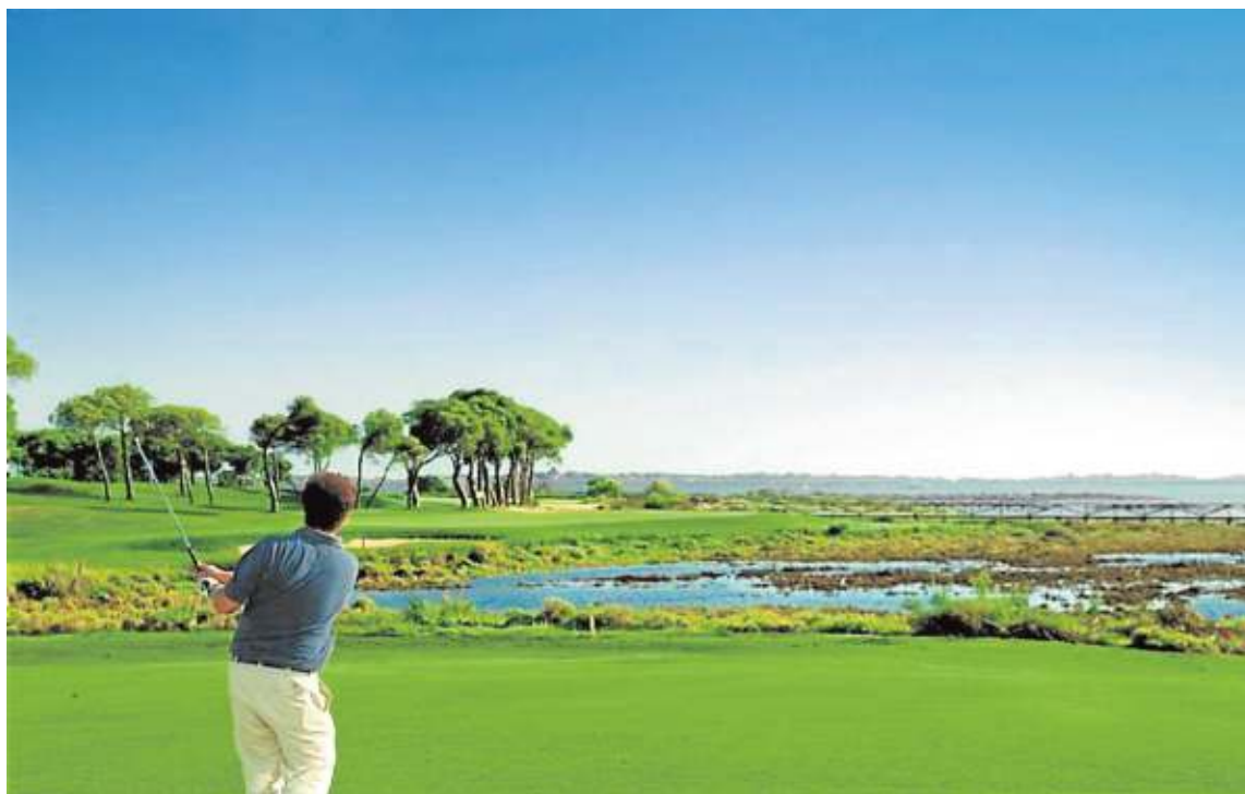
In the far west of Andalucía, El Rompido golf course forms part of the Río Piedras marshes.

They are working on promoting Huelva as a destination in eastern European countries, through agreements with tour operators such as Itaka (Poland) and Travel Group Fischer (Czech Republic), and this is consolidating the province as a holiday destination in these emerging markets. Thanks to these agreements, 4,000 visitors have booked holidays from these two countries