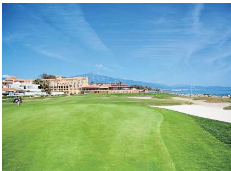
Guadalmina will host the Open de España for the first time.

At that time, the delicate economic situation was made worse by the aforementioned rise in IVA, which came as a shock to the golf courses because the rate increased from eight to 21 per cent. Despite pressure from the Junta de Andalucía and the Royal Spanish Golf Federation, and also some leading politicians close to the government, such as Esperanza Aguirre and José Manuel Soria, the Ministry of Finance refused to consider golf as a tourist activity, which would have