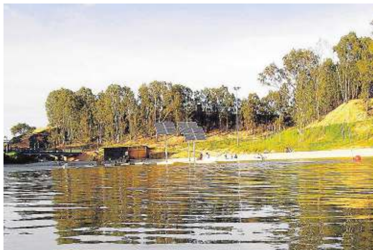
Parque Moret, in the town of Ayamonte.