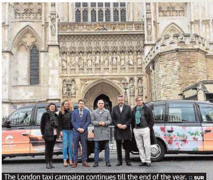
The London taxi campaign continues till the end of the year.

"Having 20 per cent of the golf courses in Spain is very important for Andalucía," said the regional Tourism Minister