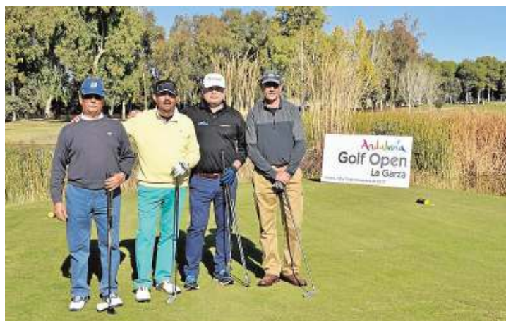
▲ Andalucía Open. Linares in Jaén province recently hosted the first edition of the Andalucía Open, a competition aimed at promoting amateur golf across the region. The week-end attracted around a hundred competitors.