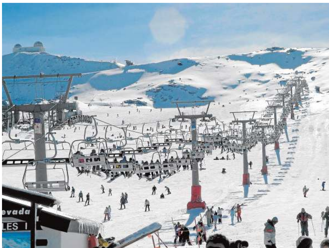
The ideal winter destination for all the family to enjoy the snow and other attractions. :: SUR