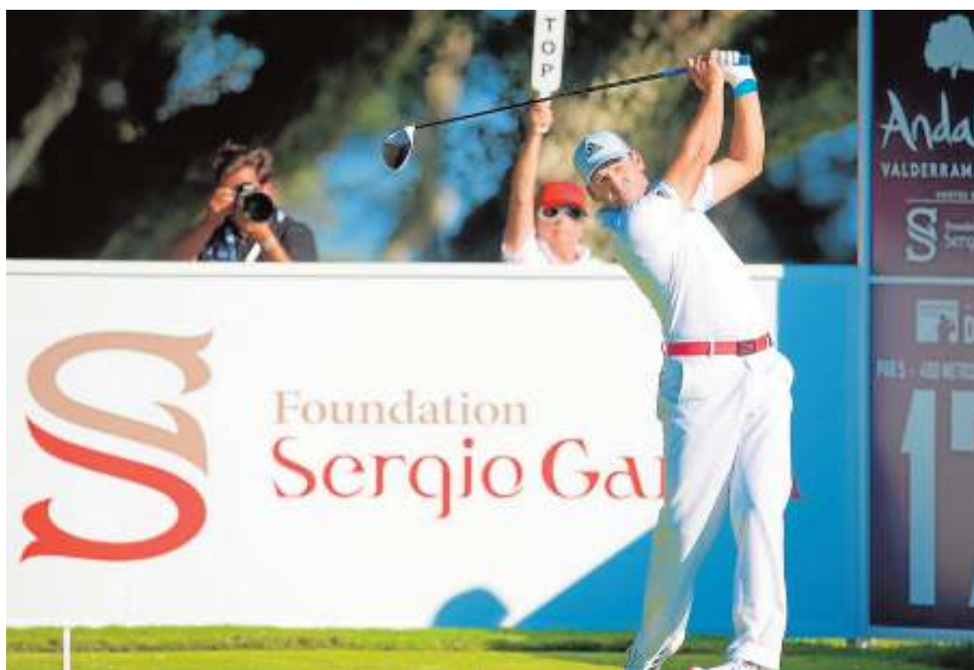
▲ Andalucía Masters. The Sergio García Foundation recently presented a cheque worth 123,116 euros to the X-ray unit at the La Paz hospital in Madrid. The sum raised during the Andalucía Masters held at Valderrama will go towards "humanising" the unit, improving patient care on a personal level and making the patient area more welcoming by improving the decor and installations.