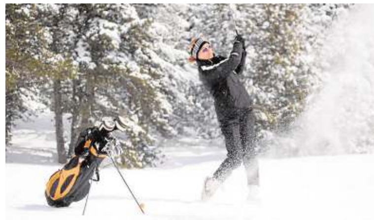
Snow Golf. :: SUR