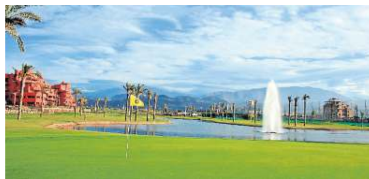
Los Moriscos golf course. :: SUR