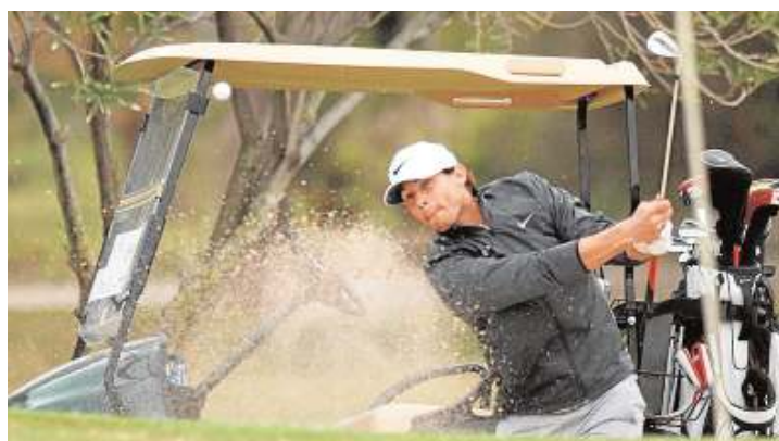
▲ Charity. Tennis player Rafa Nadal (pictured) replicated his success on the court on the course at Pula Golf in Mallorca recently as his team saw off the challenge of the team led by former golfer José María Olazabal at a recent charity competition which raised 500,000 euros for children with mental disabilities.