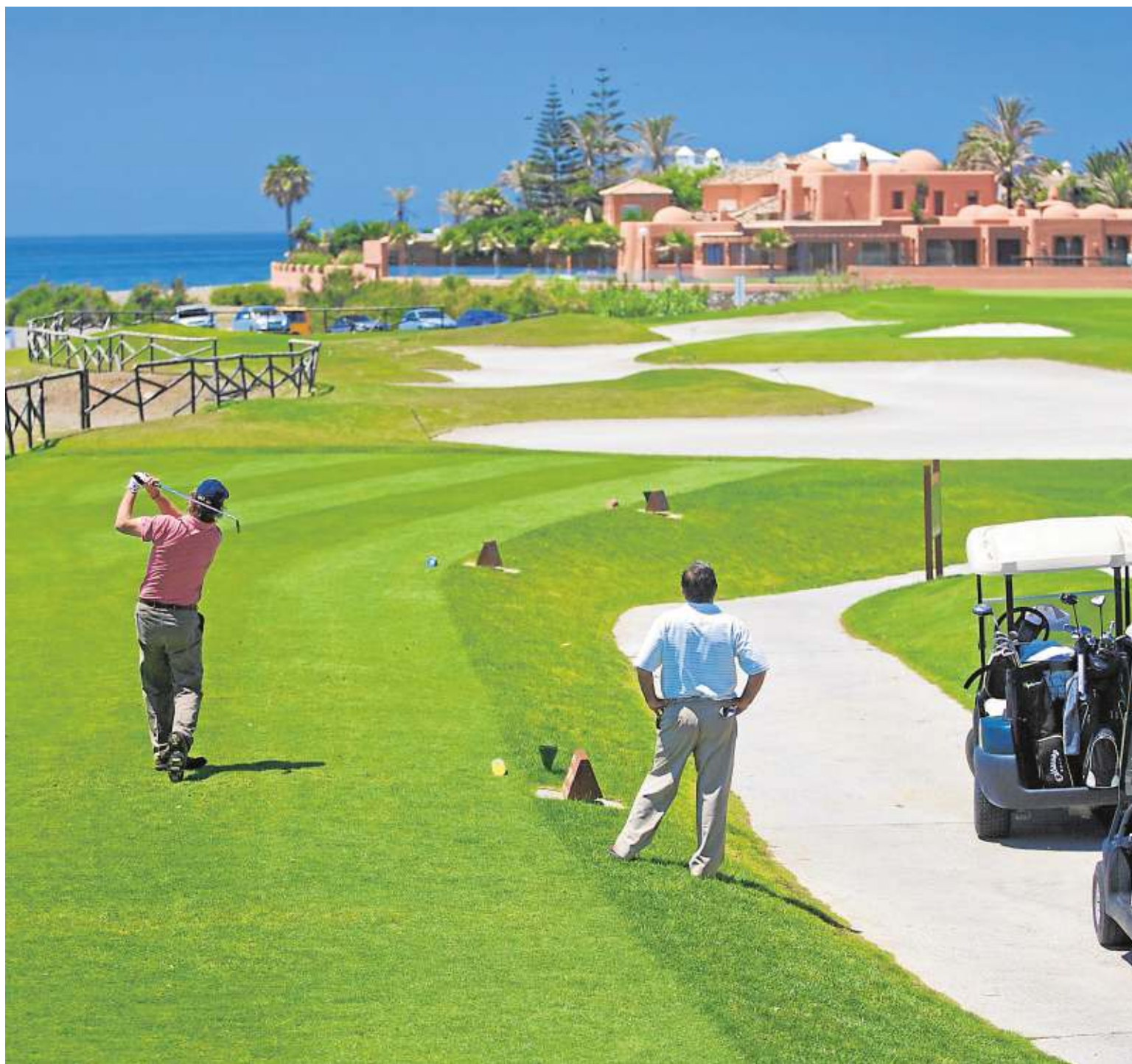
Over half a million golf tourists came to Andalucía last year.

The sector, which this year surpassed half a million visitors, has confirmed its recovery but the construction of further courses is not yet on the table