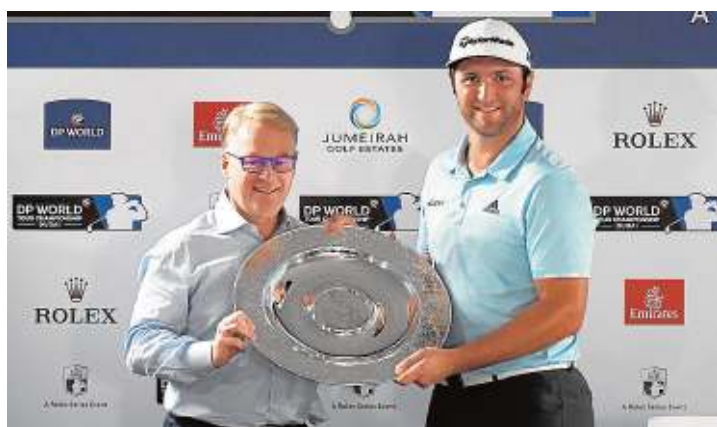
▲ Rookie of the year. Despite hardly playing all year because of his PGA commitments, Jon Rahm, 23 and from the Basque Country, recently won the Sir Henry Cotton trophy - given to the rookie of the year on the European Tour.