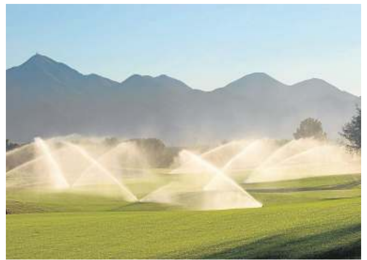
Recycled water is often used for irrigation. :: SUR