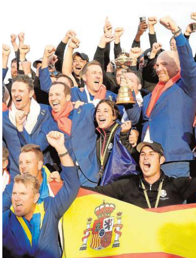
The Ryder Cup has a Spanish accent again, thanks this time to Sergio García and Jon Rahm's contribution to the European team.

Rahm said that in the match against Tiger Woods, he felt he was back on form. "I was playing like Jon Rahm again and was able to control my emotions. I think I was quite balanced all day. You could say I have played the most frightening golfer, the best one in history, who is still doing well. I couldn't be happier to have been able to help the team," he said.