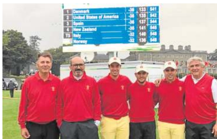
▲ World Championships. Spanish golf claimed its fourth medal in the men's World Amateur Team Championship with a third-placed finish at the Carton House Golf Club in Maynooth (Ireland) last month.