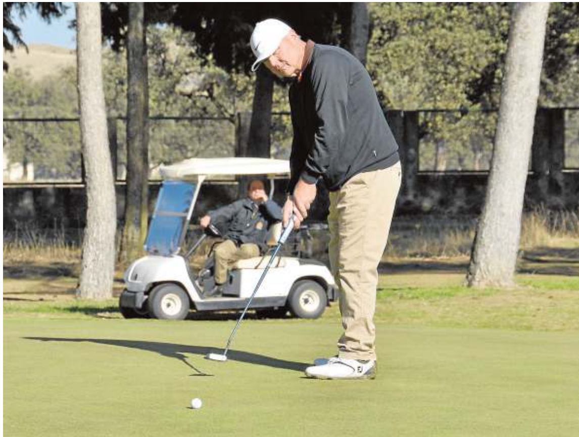
The nine-hole La Garza golf course is perfectly integrated into the countryside.