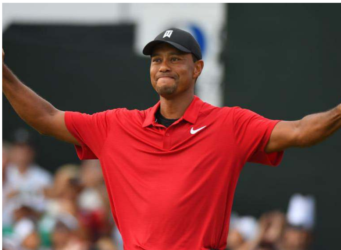
▲ Tour Championship. Tiger Woods claimed his first victory in five years in Atlanta last month, a week before the start of the Ryder Cup. The 42-year-old won the Tour Championship by two shots, sealing his 80th PGA Tour victory and pulling him within two wins of Sam Snead's record. This came a year after Woods feared he would never play golf again.