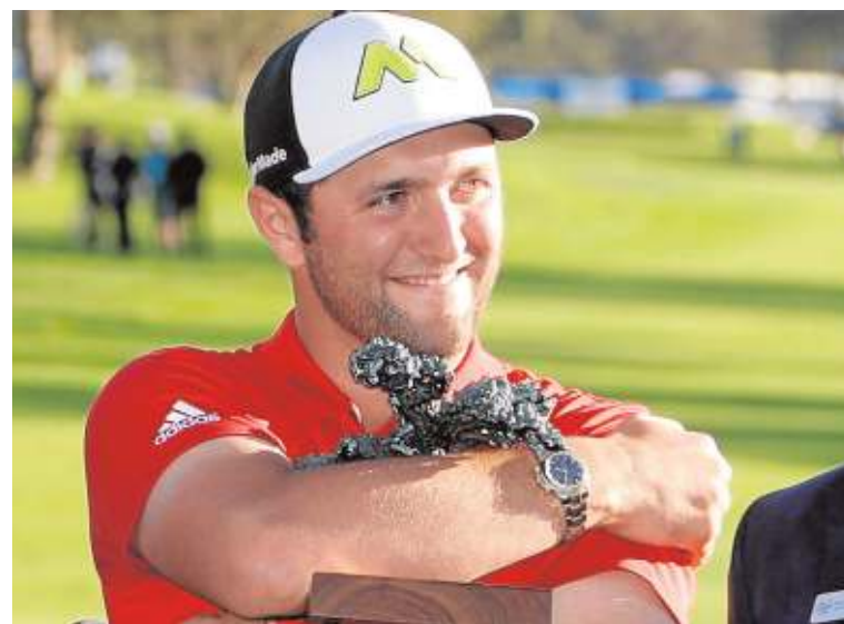
Rahm, after winning the Farmers Insurance Open.