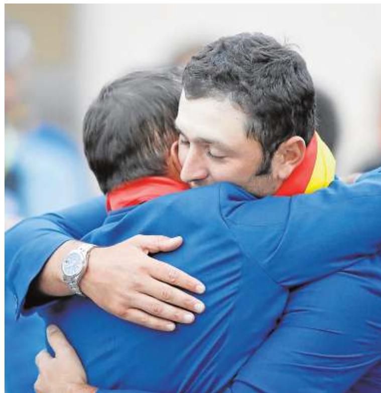
A hug for García and Rahm after playing in the Ryder Cup together for the first time.