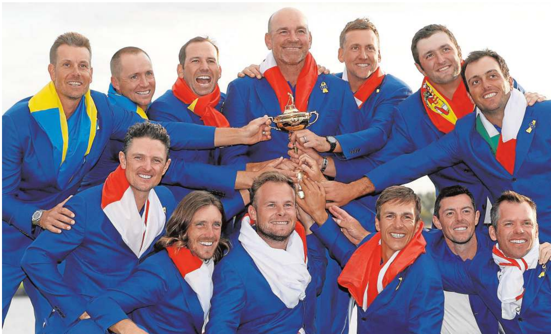
The 12 members of the European team and their captain, Thomas Bjorn, posing with the trophy.