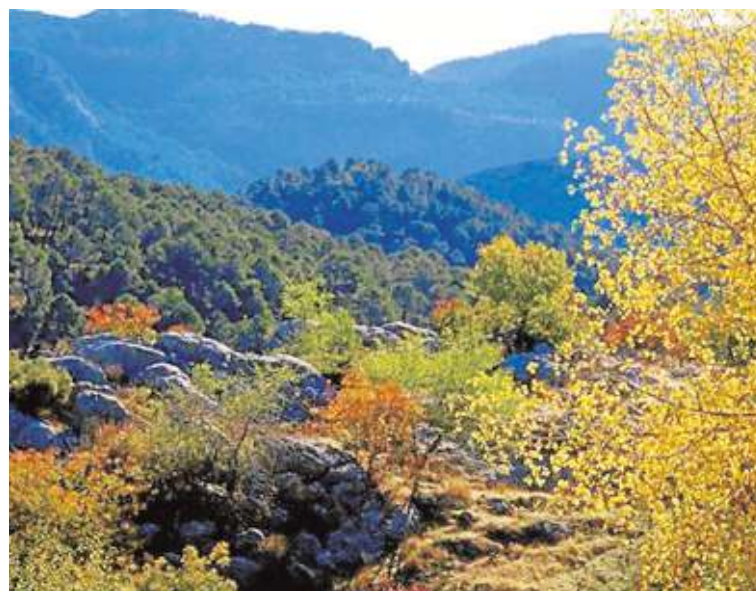
A route through the Sierra de Cazorla.