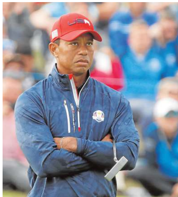
Tiger Woods ended with zero points.

The European team won with the third-best ever margin in their favour, with seven points, close to the nine with which they won in 2004 and 2006. One of the main figures in the European triumph was Italian Francesco Molinari, who won his five matches, becoming the first European to achieve something which three Americans had done before: Arnold Pal-