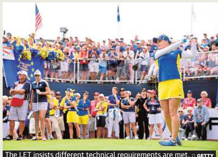
The LET insists different technical requirements are met.

There are 102 golf courses in Andalucía, of which approximately half are in Malaga province and just over 20 per cent in Cadiz.