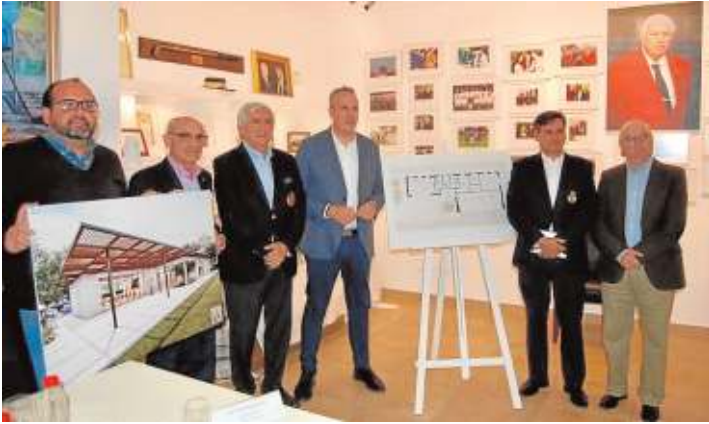
▲ La Cañada. La Cañada golf club in San Roque recently presented plans for its new high performance centre which will be constructed in early 2019. The new centre will benefit 270 children who belong to the club.