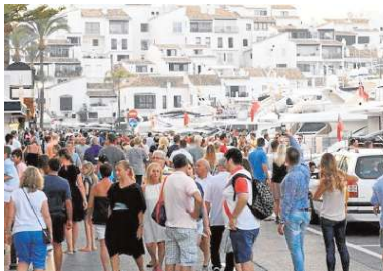
Puerto Banús, always lively. :: SUR

enced players but also those who are just beginning. One of its many attractions is that it offers three different courses, suitable for any level of handicap, high or low. Everyone who plays here enjoys themselves and can find a course which best adapts to their level of play. These courses are also in a unique setting, with no noise, away from the bustle of the towns on the Costa del Sol.