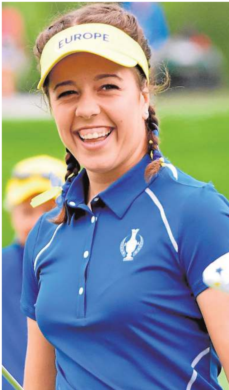
The competition takes place every two years.

For the Costa del Sol Tourist Board, the Solheim Cup would be a