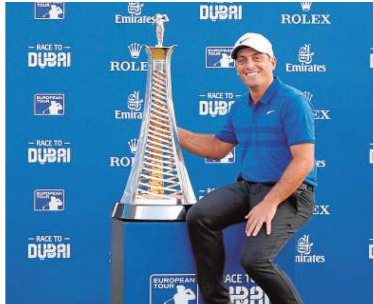
◀ Race to Dubai. Italian Francesco Molinari rounded off his best season to date with victory at the Race to Dubai in November. The British Open winner and star of the Ryder Cup has finished the season as European number one.