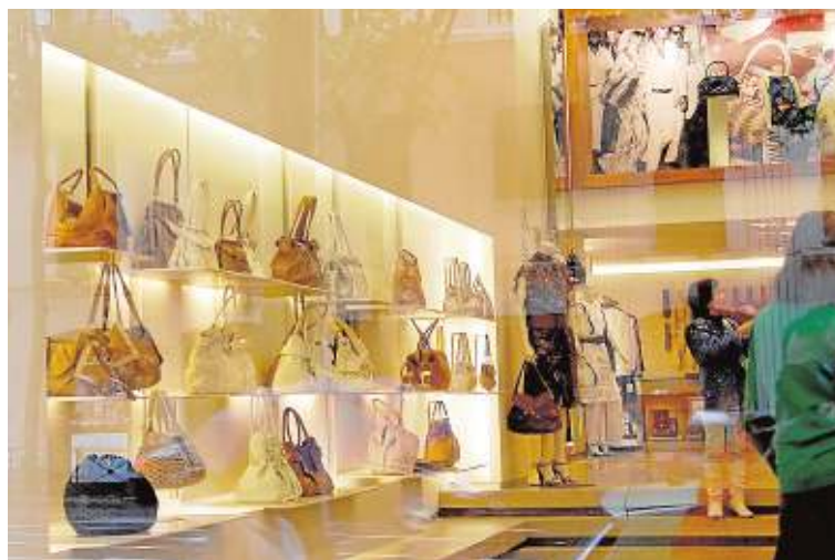
Marbella is the place to shop for luxury designer labels. :: SUR

Also in the Marbella area is the Villa Padierna Golf Resort, whose courses form an important part of the Costa del Golf. Some of the best golfers in the world have played here. The courses at Villa Padierna are famous because their rounds are not only suitable for experi-