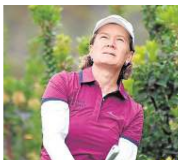
Veteran Catriona Matthew.