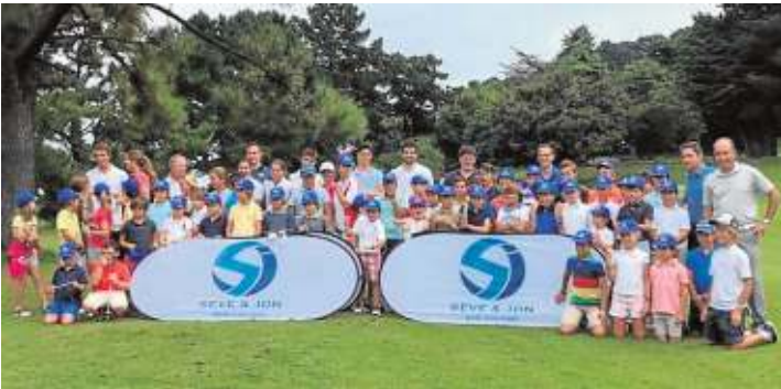
▲ Charity. The Seve Ballesteros Foundation has received 100,000 euros from the EurAsia Cup 2018 organisation which, alongside proceeds from the ongoing Seve & Jon Golf For Kids tour (pictured), will go towards cancer research.

► Tourism. The regional Sports and Tourism departments hosted a stand at the Signature Travel Network conference in Las Vegas from 27 to 30 November. This was the first time that Andalucía, promoting golf tourism as one of its main attractions, was represented at this important event -one of the biggest for operators in North America. :: SUR