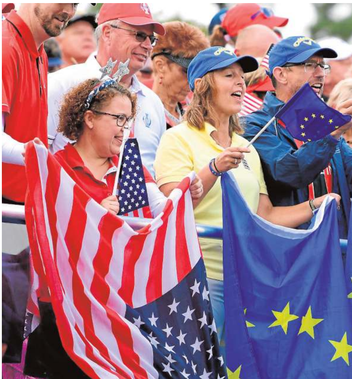
The Solheim Cup was created in 1990 and is very similar in format to the Ryder Cup.