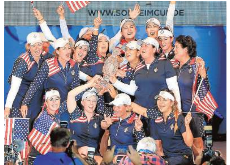
The USA has dominated the competition in recent years.

The biennial Solheim Cup is played by 12 teams representing Europe and the USA and is one of the most popular sporting events in the world. It takes place over three days, like the Ryder Cup, and numerous activities are organised beforehand.