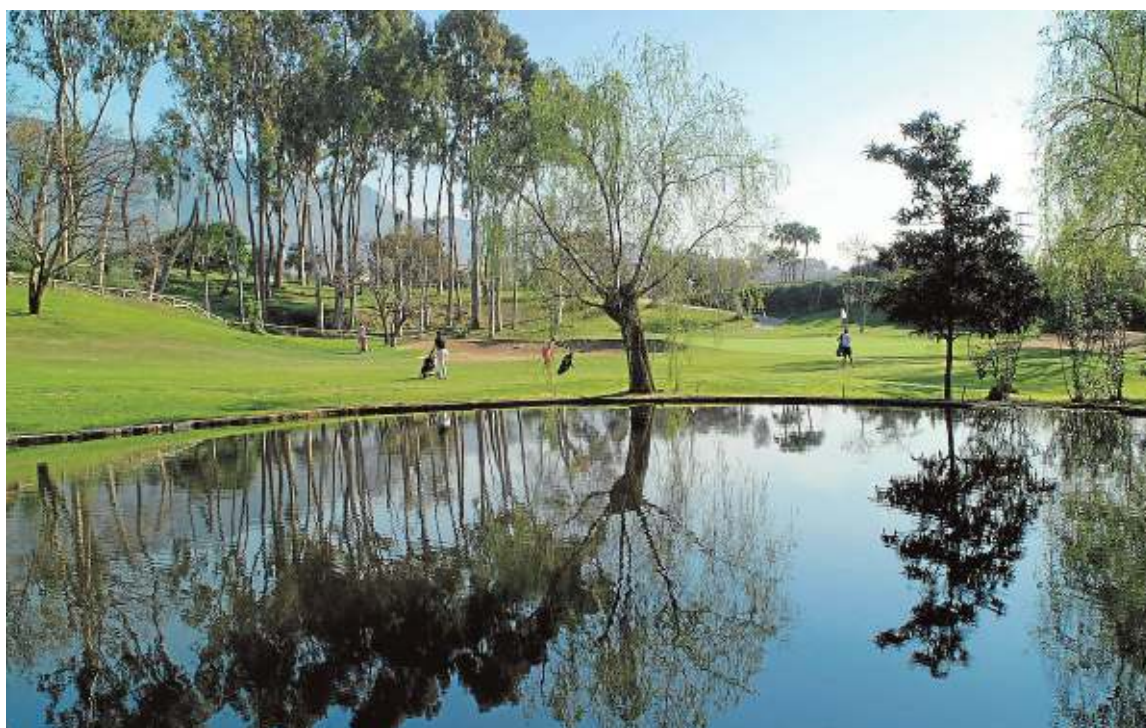
The area's golf courses are part of Costa del Sol history and very popular at this time of year.

Los Naranjos, meanwhile, is one of the best golf courses on the Costa del Sol and is right in the heart of Marbella. Since its creation in the mid-1970s, a significant