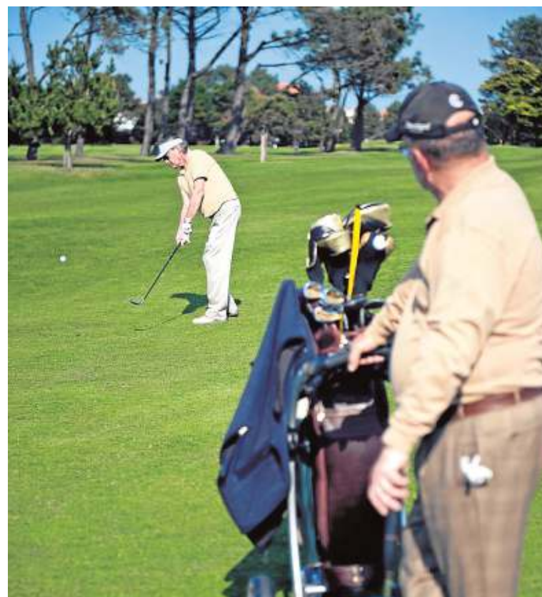
More than 30 million tourists came to Andalucía last year. ■ SUR

This Christmas, 2,213 hotels were open in Andalucía, with a total of 199,253 rooms available. In November, the occupancy per place was 45.4 per cent, and it rose to 55.77 per cent at weekends. Hotels in the region employed 25,928 staff that month, compared with 38,477 in October and