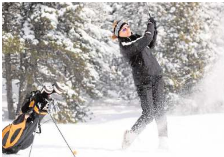
In winter you can practise 'snowgolf'. :: SUR

The ease of access to Granada city and the rest of the province means that golf tourists can practise their favourite sport on some of the local courses,