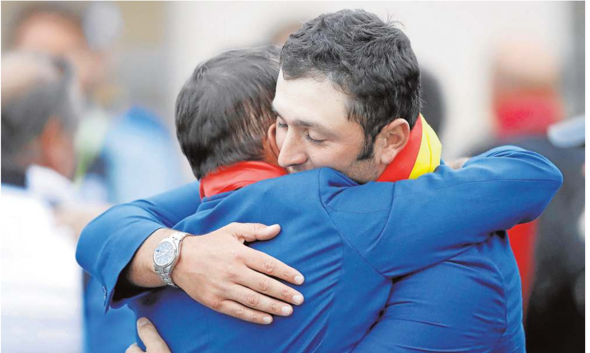
García and Rahm hug after Europe's win over the US at the Ryder Cup in September.