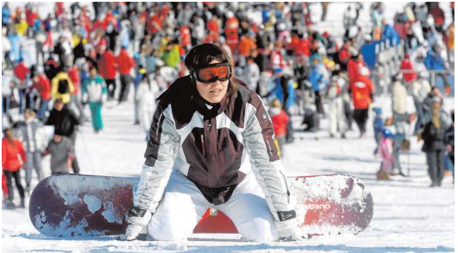
A winter destination to enjoy the snow and facilities for the whole family.

This year the resort has also introduced new functions on its mobile application. In addition to improvements and updates to the information provided about ski conditions (pistes, lifts, weather, webcams etc), the Sierra Nevada app now incorporates maps and trackers in 3-D as well