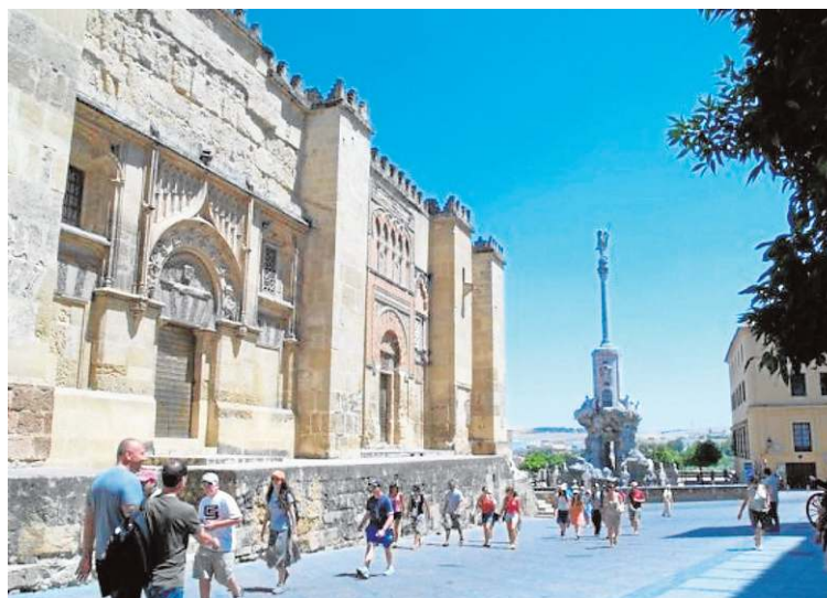
May is the most popular month for tourism in Cordoba.

our of Nuestra Señora de la Salud, the patron saint of the city. At the end of May, the fairground is filled with people, some on horseback, many women wearing the traditional long frilly dresses, and there is a lively atmosphere in the bars which line the fairground and are open to everybody, residents and visitors alike.