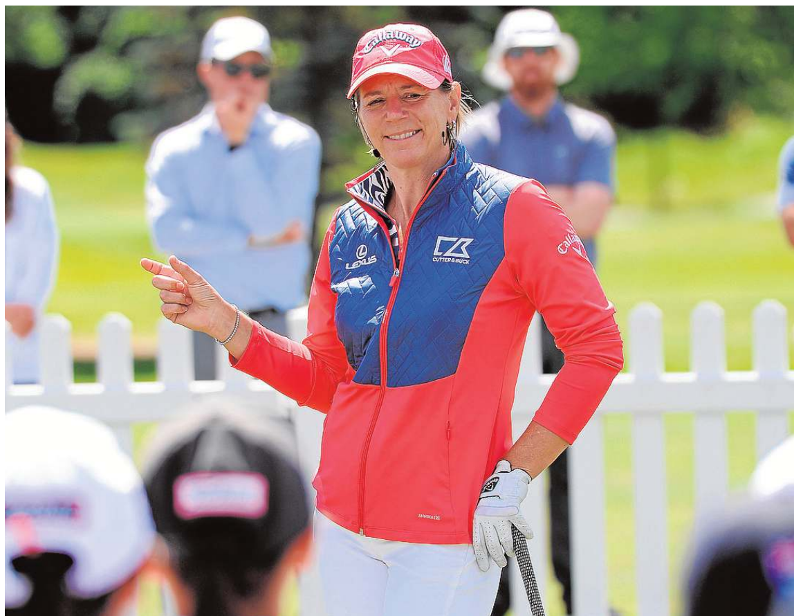
The tournament is being screened on Movistar Golf, Teledeporte and Andalucía TV.

Golfing legend Annika Sorenstam is the ambassador for the first edition of this Ladies European Tour tournament