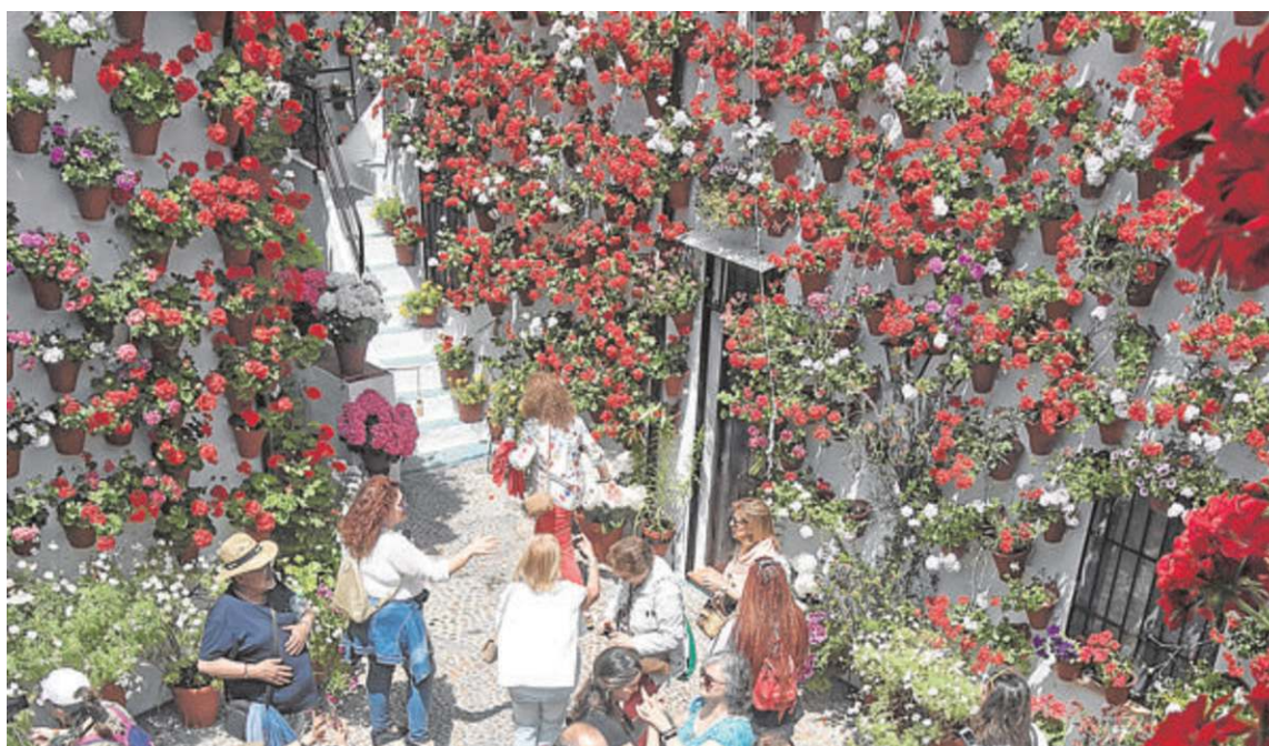
The city's patios are filled with flowers in the weeks before the late May fair.

In the busiest areas, especially San Basilio - which is the Alcázar Viejo