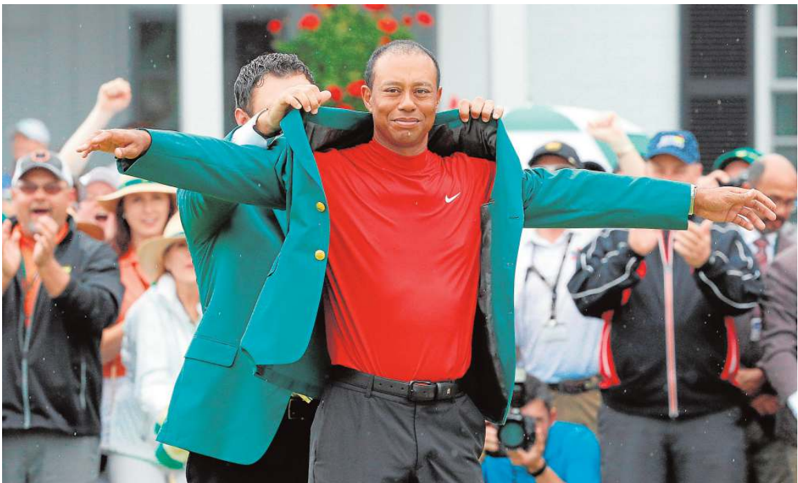
Woods is helped into the legendary Green by the 2018 winner, Patrick Reed.

The excitement around Tiger Woods has been increasing from the moment he returned to golf at the end of 2017, finally without pain, after previous injuries and multiple operations on his back. Before that, he had touched rock bottom and was arrested in May when driving under the effects of different medications. However, he put that ordeal behind when he walked onto the Albany Golf Course and began to feel part of golf again. His talent surfaced almost by