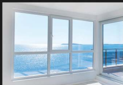
PVC & ALUMINIUM WINDOWS