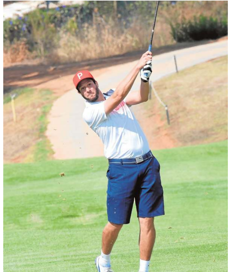
This is the biggest amateur tour in Andalucía.

On 27 July, the grand finale will be held at Guadalmina. For its part, Guadalmina has two courses, one north and one south, and also boasts unbeatable views, as well as being one of the most well-kept courses on the Costa del Sol.