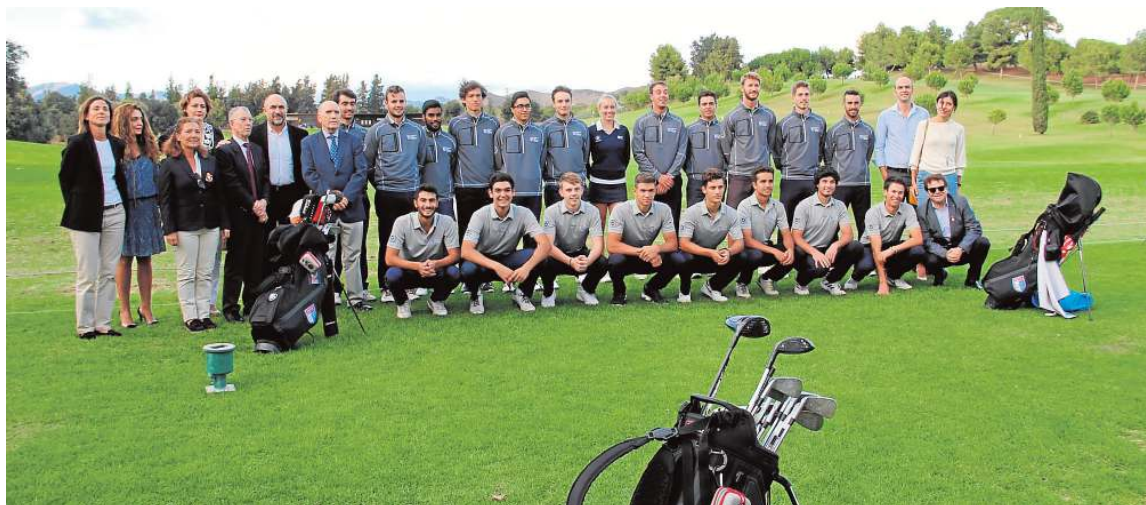
The University of Malaga has a strong golf team.