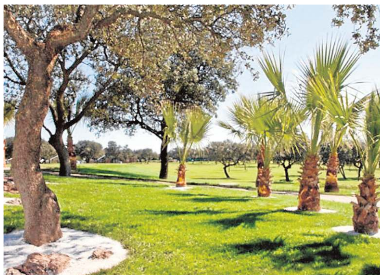
The Pozoblanco golf course.

As if all this festivity were not enough, the Cordoba Fair will also be taking place soon. It is held in hon-