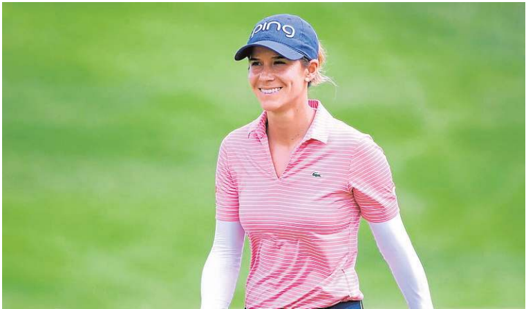
Azahara Muñoz is showing her best form again after injury.