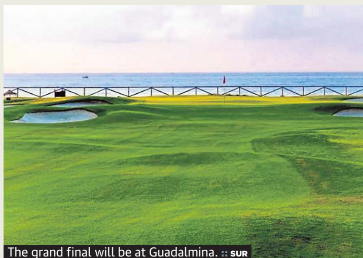
The grand final will be at Guadalmina.

Reaching the grand final at Guadalmina will depend on the results of the first four days. Those interested in taking part can register online via Oferplan or by contacting Diario SUR's commercial department. The tour, which began over five years ago, aims to beat all records this year.