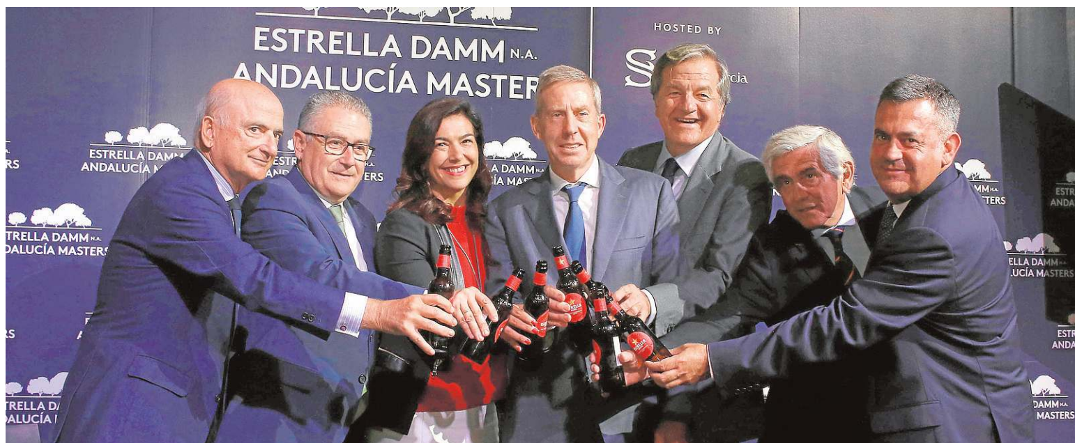
Representatives from Valderrama, federations, organisers and sponsors, after the presentation.

player to win a tournament on strokes at the Real Club Valderrama thanks to his hard-fought triumph in the 2011 edition, the 2017 Masters champion and Ryder Cup record-holder extended his relationship with the course with his second title when it returned to the international calendar of the European Tour.