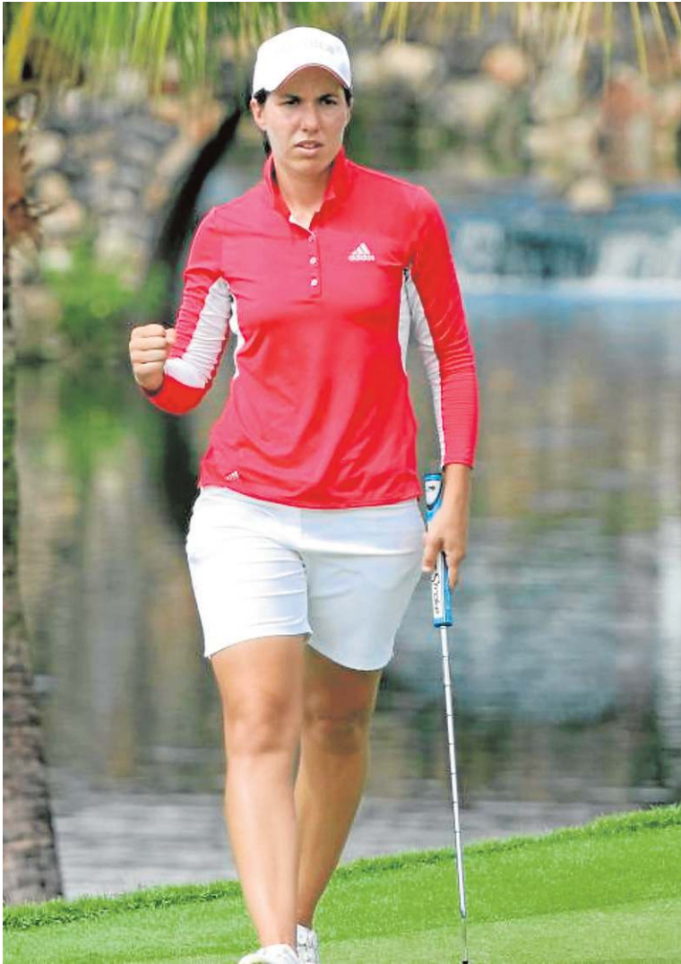
Carlota Ciganda made history by breaking into the top 10.