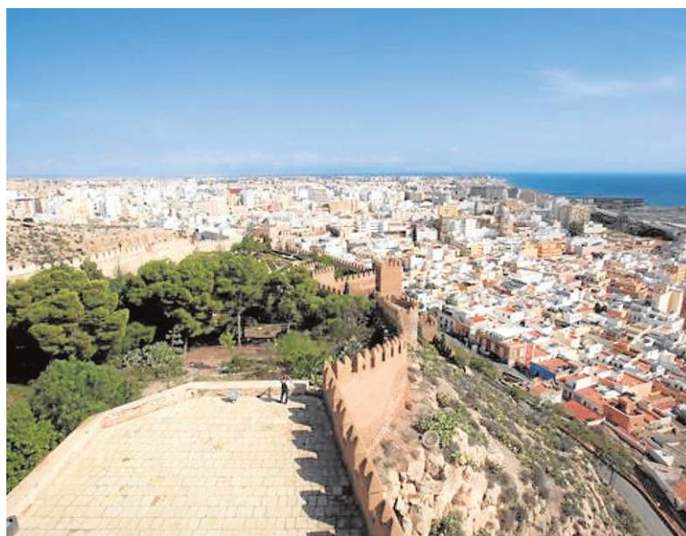
The city has numerous remains from the Moorish period. :: SUR