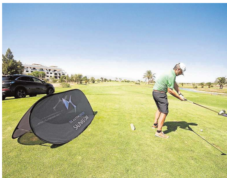
Several tournaments take place in Almeria.