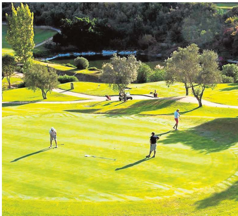
The eighth hole at Los Arqueros, which is hosting the first leg.

The registration period for the Costa del Golf Tour is still open. Oferplan has launched a voucher with which you can enjoy the competition, green fee and buggy in-