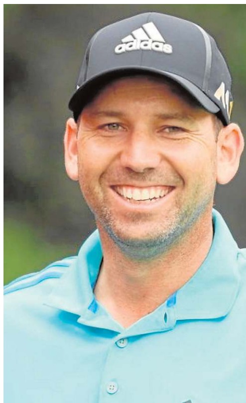
Sergio García is aiming to win again.

"I'm very excited to be coming back and also being at Valderrama in the summer, because that is the ideal time to visit the south of Spain. It is a very important part of our