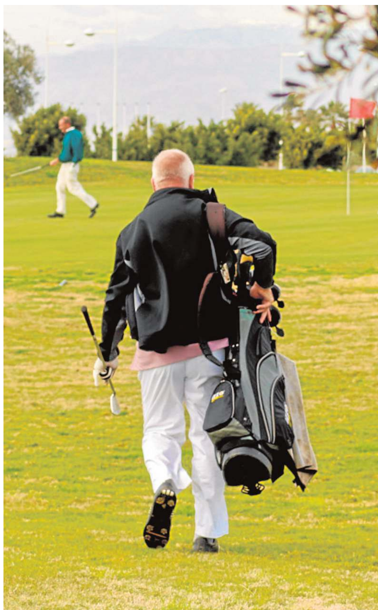
The province has some of the very best golf courses. :: SUR

The regional government wants to attract more visitors to a sector which brings millions of tourists to Europe every year