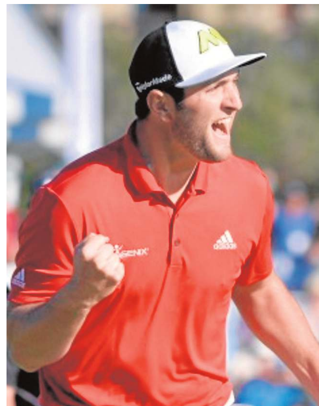
Jon Rahm's presence will be an added attraction.

country and of the world, in fact," said Rahm. "Last time I didn't play my best tournament and I missed the cut, but this year I hope to give Sergio a run for his money and fight him for the title".